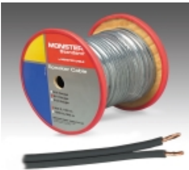
Monster™ THX Certified 14-Gauge Surround Sound Speaker Cable