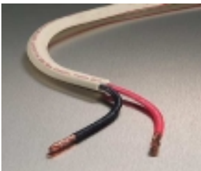
Monster™ Powerline™ THX Certified 14-Gauge Speaker Cable

The two-conductor versions (#8519C and #8525C) have the additional benefit of being THX certified. This extraordinarily hard-to-achieve certification assures that the cables transfer dialogue, music and sound effects exactly as the film's sound editors intended. Cable #8525C is THX-certified for cable runs up to 30 ft. for front speakers and 60 ft. for surrounds. Cable #8519C is THX-certified for cable runs up to 24 ft. for front speakers and 48 ft. for surrounds.