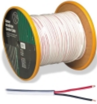
Standard 16-Gauge Surround Sound Speaker Cable